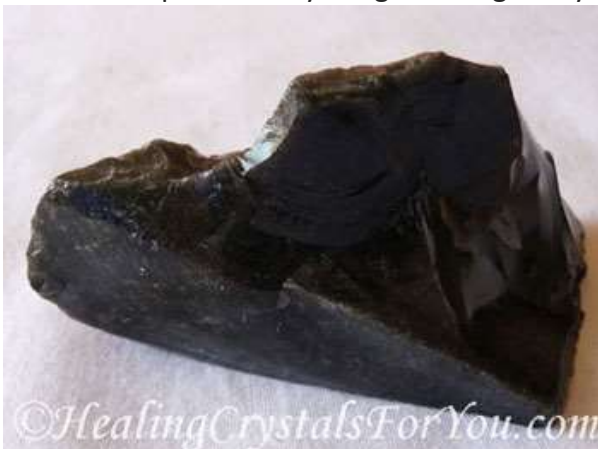
Natural Black Obsidian Stone

This stone has powerful metaphysical properties that will help to shield you against negativity.