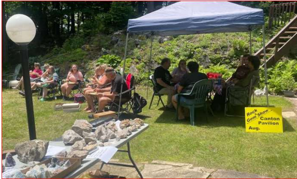
Mineral sale, auction, and give-away table

ST. LAWRENCE COUNTY ROCK & MINERAL CLUB Date: June/July, 2022