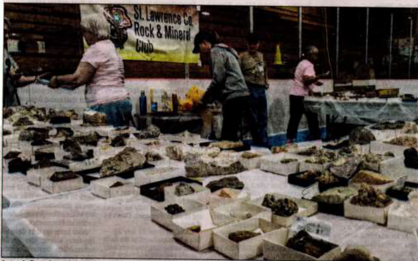
A steady flow of people kept the Canton Pavilion humming during the annual Gem and Mineral Show on Aug. 27.