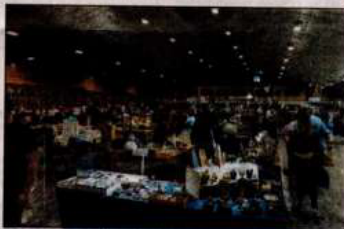
The 55th annual Gem and Mineral Show hosted by the St. Lawrence County Rock and Mineral Club was held at the Canton Pavilion on Aug. 27 and 28.