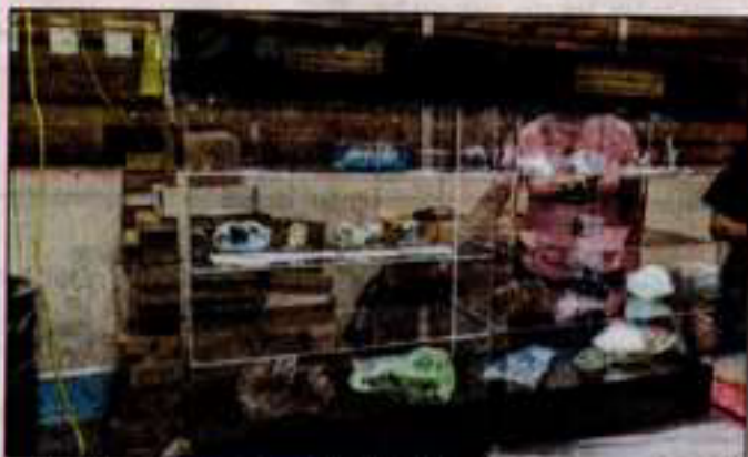
A display case at the Gem and Mineral Show in Canton on Aug. 27 features minerals found in St. Lawrence County.