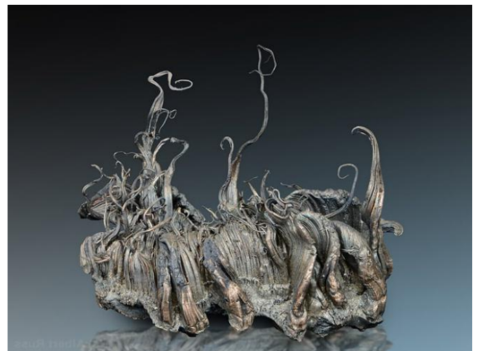
Native Silver Wire