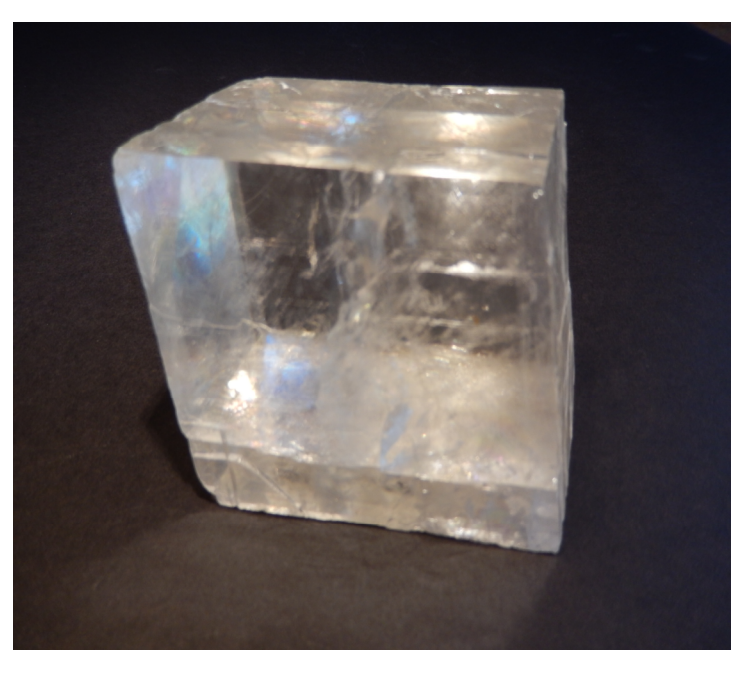
Calcite cleavage rhombohedron from St. Joe Minerals #3 Mine, Balmat, NY