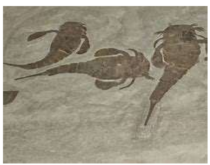
Slab fossilized Eurypterids