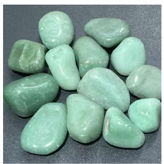
Tumbled and Polished Aventurine