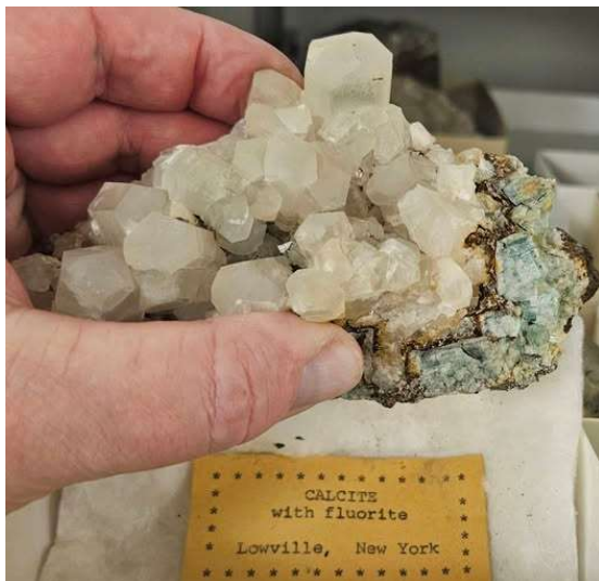
Calcite with Fluorite; Lowville, NY