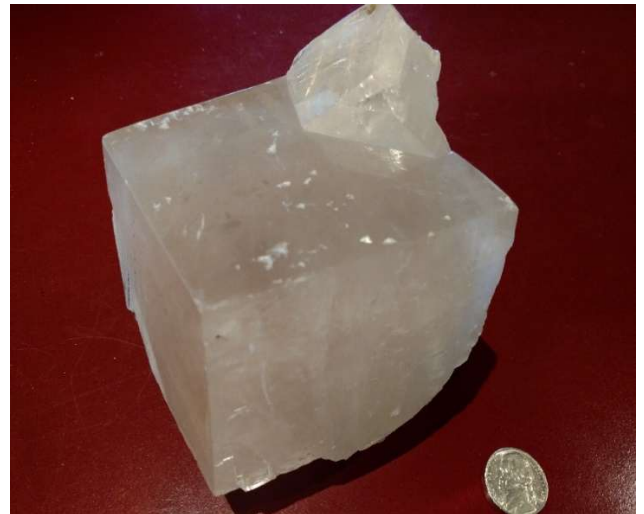
Rhombohedral Calcite 3800 level Mahler Ore Body, Balmat, NY