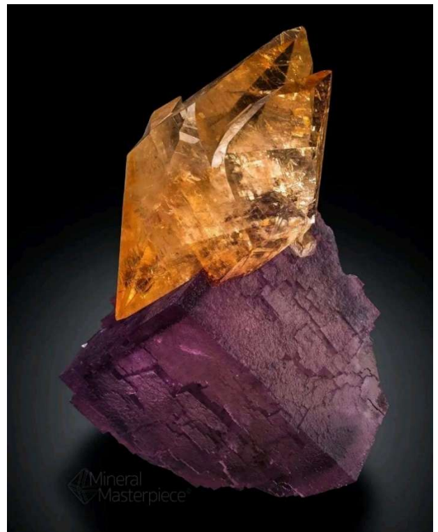
Calcite on Fluorite, Elmwood, TN