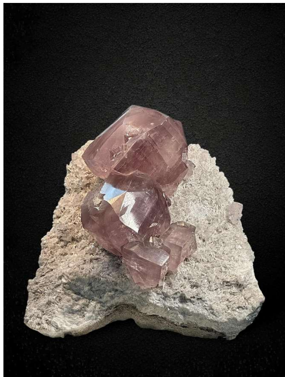
The Empress of Balmat Calcite

ST. LAWRENCE COUNTY ROCK & MINERAL CLUB Date: May, 2025